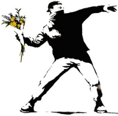
Society as change (above: Banksy)...

Department of Sociology and Social Work University of Wisconsin-Stevens Point